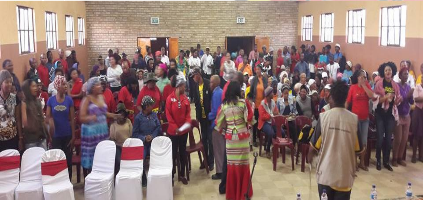
Comrades chanting and singing revolutionary songs

We all know that if you have young people on your side, you can build or destroy the revolution. There can be no revolution in South Africa and anywhere in the world without the involvement of the fresh blood which embodies the future of its nation, of an organization and that will carry the load for the elders, becoming the engine of organization, for the realisation of organisation's aspirations and its founding mission. The youth are the pride, drivers of the nations.