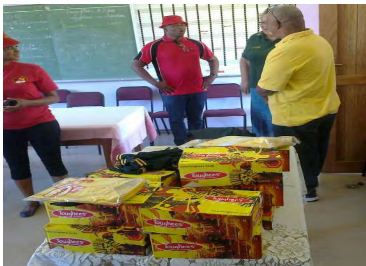
Joe Slovo Right to Learn Campaign (JSR2L) held in Ritchie