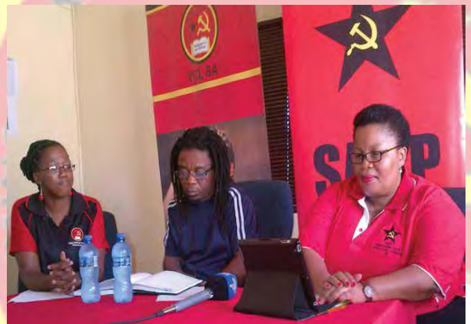
Media Launch of the Campaign

The challenge of the Party and the left is to ensure that the gains made in the struggles do not only benefit the elite women, but empower working class and poor women in rural and urban areas. The seeds of transformation can liberate the lives of working class women. Which seeds eventually become rooted and nurtured depends on strategy and struggle based on the correct understanding of the interconnection between oppressive gender social relations and women's oppression. Such strategy and struggle must go along with the appropriate organisational forms to carry out these tasks.