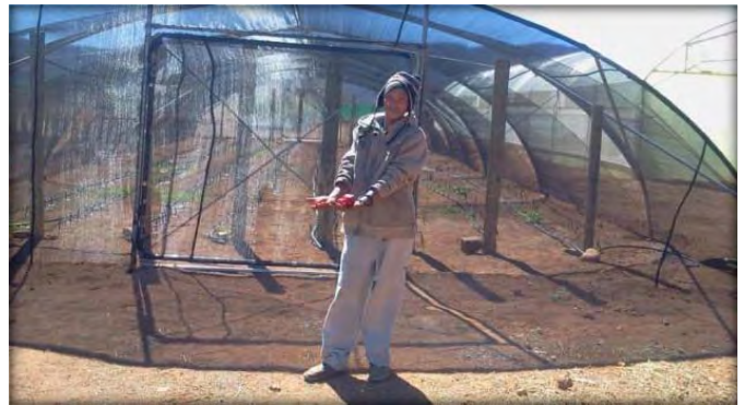
Construction successfully completed

The comrades have their own nursery on site and will produce their own seedlings for the tunnel. Currently winter is starting and therefore they will, if seedling is ready, then start with planting.