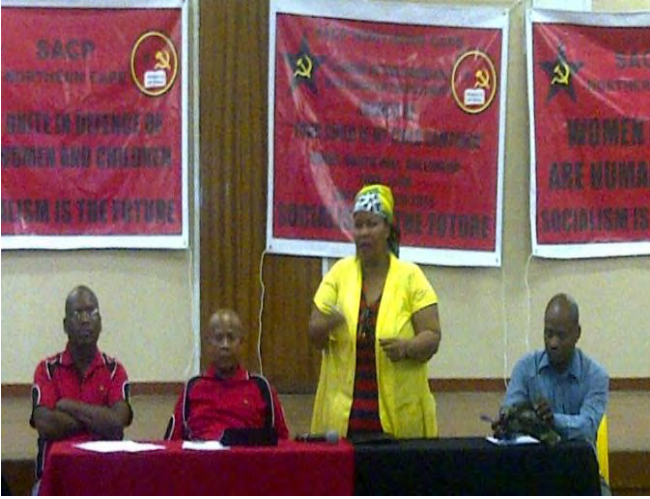
Launch of the “Your Child is my Child” campaign

On the 14 th of March 2013 the “Your Child is my Child” campaign was launched at Bantu-Hall, in Kimberley. The provincial launch followed the national launch under the theme “Celebrating 100 years of Women Participation within the Struggle for Classless Society.”