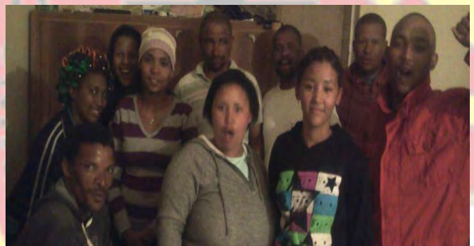
YCLers attending the Socialist Forum

The topic was Communist Cadres and their role in the community. The forum was lively and had good participation from the members in attendance. In the past as the District we struggled to build structures, develop cadreship and branches that are functional but persistence and perseverance under the leadership of the SACP has helped us to build an exciting, organic and vibrant YCLSA! We are proud to be part of it.