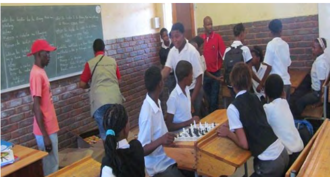
Maikalelo Primary School

The Young Communist League of South Africa committed itself to make education fashionable, through its Joe Slovo Right to Learn Campaign. This campaign is in line with the Free Education Campaign to promote access to basic education through visiting schools. The YCLSA continuously encourages its branches to adopt schools and play a significant role in ensuring that there is collective encouragement between, teachers, parents and learners to promote peoples education for peoples power.