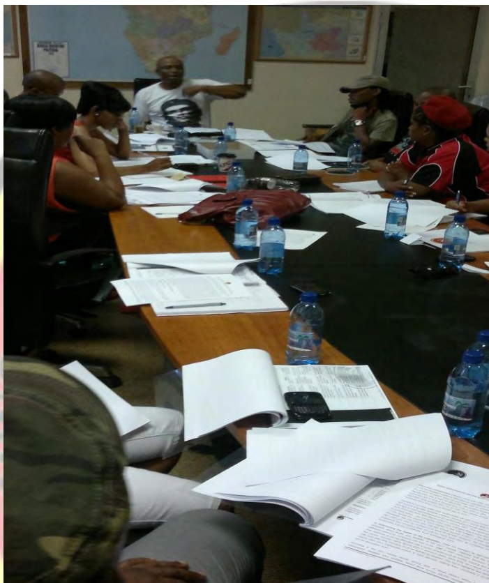
YCLSA PEC 02-03 February 2013 (above) Post PEC Press Conference (left)